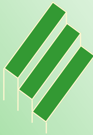
3 Tier Plant Stand