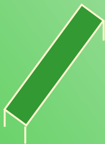
1 Tier Plant Stand

Plant Stands are available in 3 different models, either 1, 2, or 3 tier. Each tier is 0.3m deep, 1.25m wide, and 0.3m tall. Work Benches contain two shelves, one above the other. Work Bench's are 0.5m deep, 1.25m wide and 0.9m high, and can also come with a 1.25m return to create a corner unit.