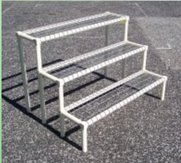
3 Tier Plant Stand

Aussie Shade Houses Plant Stands and Work Benches are made of all Australian products, that have been designed to stand up to Australian conditions. They are also manufactured in Australia, so we can guarantee our workmanship on our entire range. Plant Stands and Work Benches are neat, tidy, and maintenance free and are designed to last. Plant Stands and Work Benches are made from UV stabilised class 12 pressure pipe, that are joined using specially designed fittings. The entire frame goes together with nothing more than a rubber mallet. Once the frame is assembled, simply place the steel shelving on, and your Plant Stand or Work Bench is complete. You just have to add the plants!!