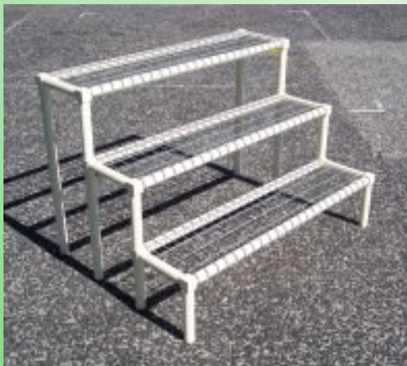
3 Tier Plant Stand

Aussie Shade Houses Plant Stands and Work Benches are made of all Australian products, that have been designed to stand up to Australian conditions. They are also manufactured in Australia, so we can guarantee our workmanship on our entire range. Plant Stands and Work Benches are neat, tidy, and maintenance free and are designed to last. Plant Stands and Work Benches are made from UV stabilised class 12 pressure pipe, that are joined using specially designed fittings. The entire frame goes together with nothing more than a rubber mallet. Once the frame is assembled, simply place the steel shelving on, and your Plant Stand or Work Bench is complete. You just have to add the plants!!