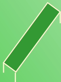
1 Tier Plant Stand

Plant Stands are available in 3 different models, either 1, 2, or 3 tier. Each tier is 0.3m deep, 1.25m wide, and 0.3m tall. Work Benches contain two shelves, one above the other. Work Bench's are 0.5m deep, 1.25m wide and 0.9m high, and can also come with a 1.25m return to create a corner unit.